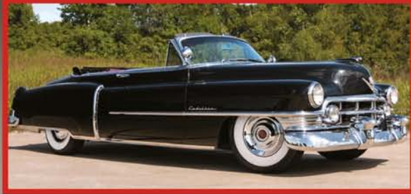
1950 CADILLAC SERIES 62 CONVERTIBLE - WITHOUT RESERVE

November 17, 18 & 19 • Dallas Market Hall