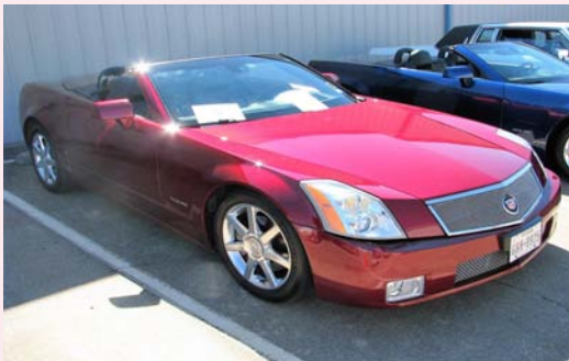
Doug Ashby's 2006 XLR convertible placed 1 st .