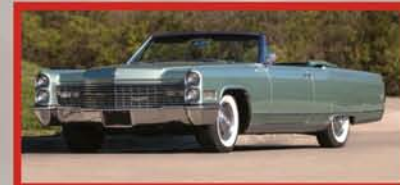
1966 CADILLAC ELDORADO - WITHOUT RESERVE