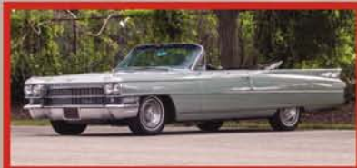
1963 CADILLAC SERIES 62 - WITHOUT RESERVE