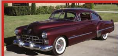
1948 CADILLAC SERIES 61 - WITHOUT RESERVE