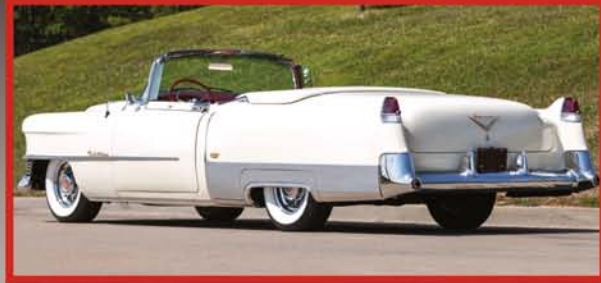
1954 CADILLAC ELDORADO CONVERTIBLE - WITHOUT RESERVE