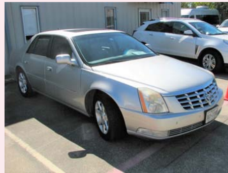
Steve Overby's 2007 DTS 2007 placed 3 rd .