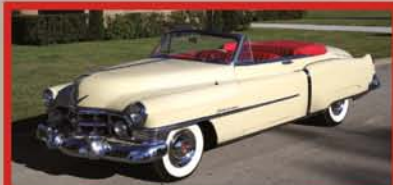
1950 CADILLAC SERIES 62 - WITHOUT RESERVE