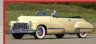
1947 CADILLAC SERIES 62 - WITHOUT RESERVE

To Bid or Consign • LeakeCar.com • 918.254.7077