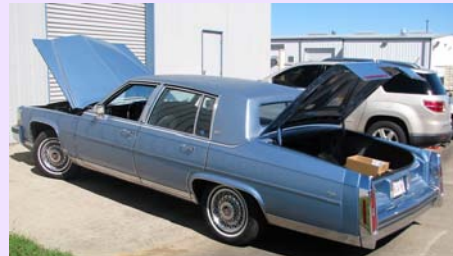
W.G. Horst's blue 1989 Four Door Brougham 1989 3 rd place.