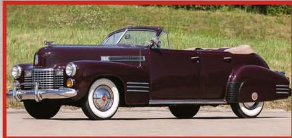
1941 CADILLAC SERIES 62 CONVERTIBLE - WITHOUT RESERVE