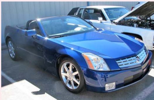
David Clemans, 2007 blue XLR placed 2 nd .