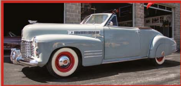
1941 CADILLAC SERIES 62 TUDOR CONVERTIBLE - WITHOUT RESERVE