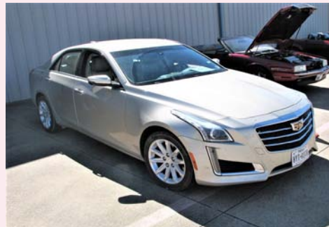
Minnie Bedrick's new CTS 2015 was honored with a 3 rd place win.