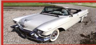
1957 CADILLAC SERIES 62 - WITHOUT RESERVE